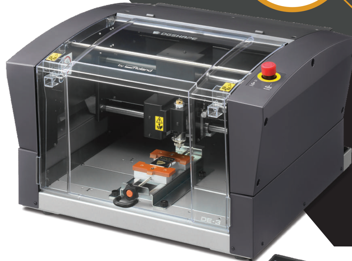
*shown with optional center vise

Enables standard engraving as well as surface levelling and hole drilling.